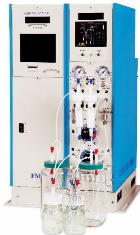
EconoTrace PFC SPE System