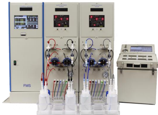
Turbo Trace PFC System